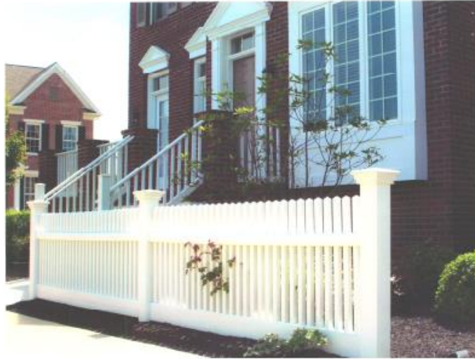
Manchester Scalloped – 4'x8' Section