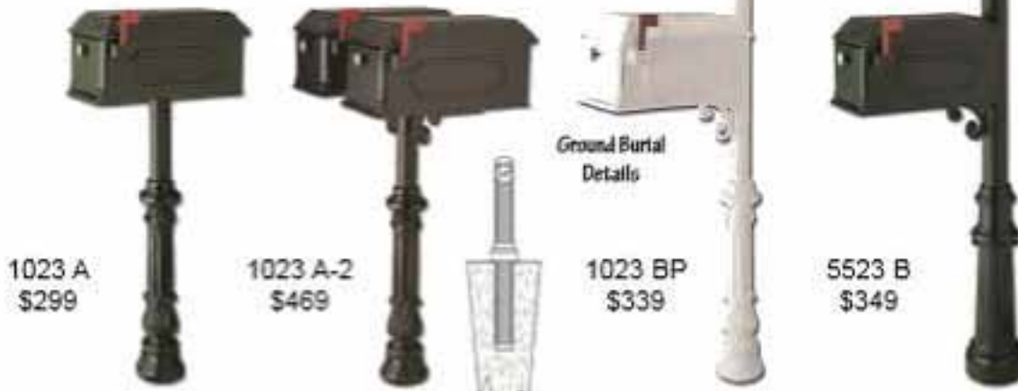
1023 A $299