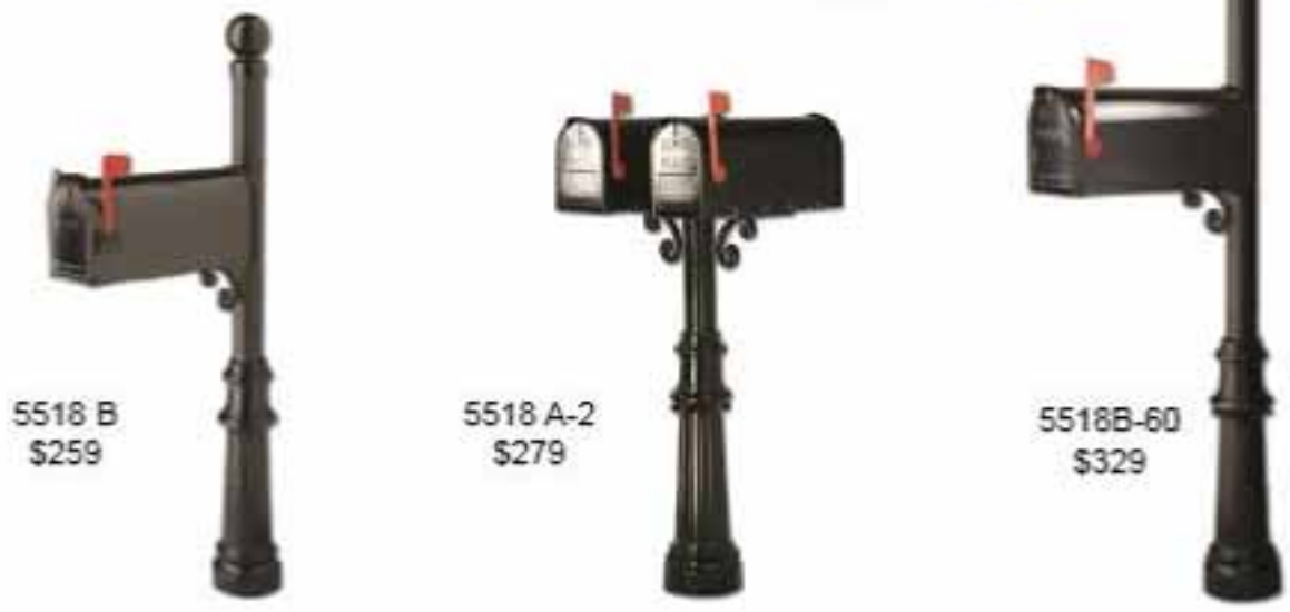
5518 B $259