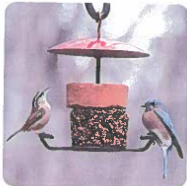
Hot Pepper Stackables® Carolina Wren & Eastern Bluebird