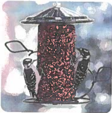
Hot Pepper Seed Cylinder Downy Woodpeckers