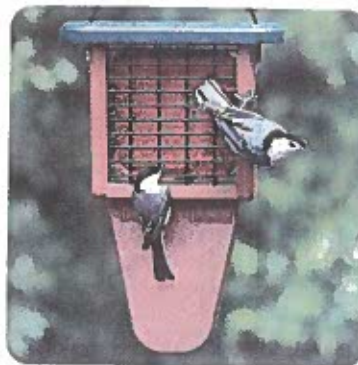
Hot Pepper Suet Cakes Carolina Chickadee & White-breasted Nuthatch