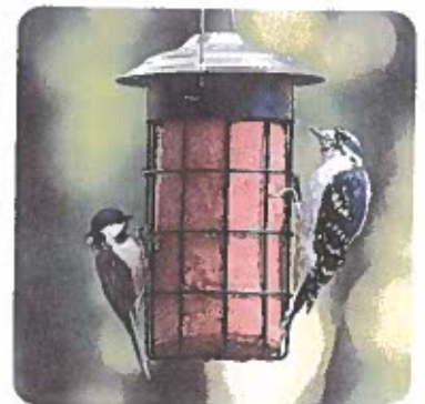
Hot Pepper No-Melt Suet Cylinder Carolina Chickadee & Downy Woodpecker